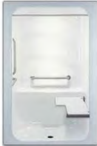
Photograph Illustrates Package One - Handed by Valve Wall Left

Due to the nature of the materials, dimensions may vary +/- 1/2".